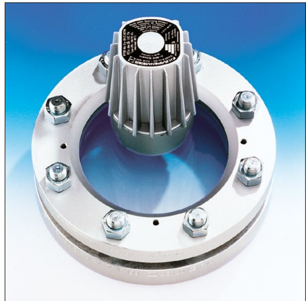
Application as combined light/sight port, fitted to a circular sight glass assembly to DIN 28120; fastened with hinged bracket