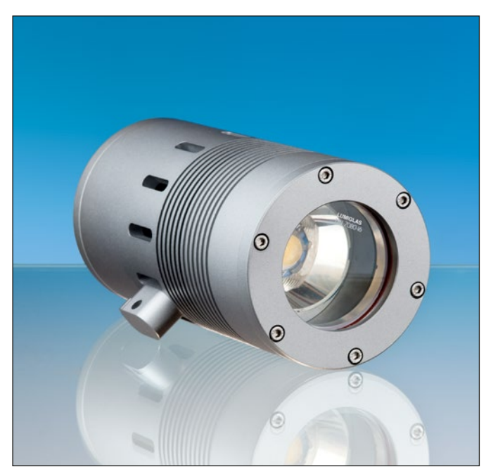
Lumistar luminaire ASL 57-LED