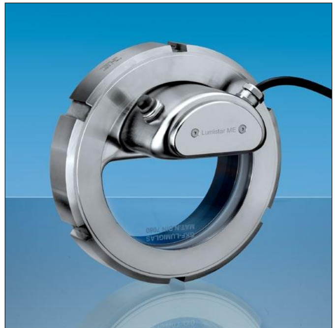
Lumistar luminaire ME-LED, installed in a screwed sight glass unit similar to DIN 11 851