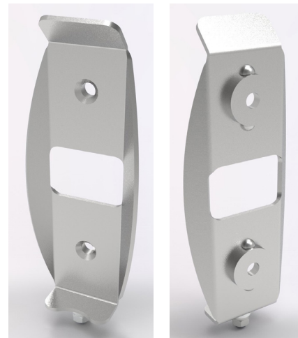
Magnetic Clamp Stowage Point