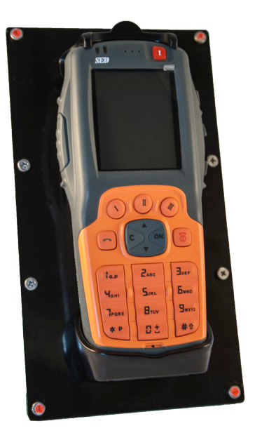
OPH-810R / OPS-810R

The OPS-810R handset has all the same functions as the OPH-810R, as well as a shunting mode and support for remote communication equipment and remotespeakermicrophone* . Replaces the deprecated Ti-GR550R. *Optional