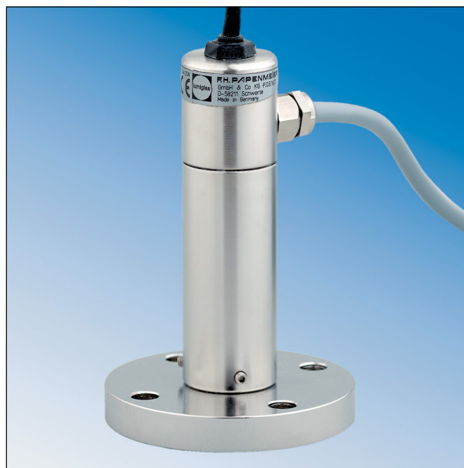
Mini Lumistar luminaire USL 31 for BioControl applications

Transformers for 12 V or 24 V secondary voltage can be supplied on request.