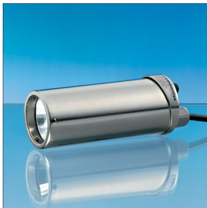
Lumistar luminaire USL 33-LED

The luminaire mounting (hinged bracket) is included in the scope of supply. The flange collar for mounting on screw-type sight glass fittings DN 50/65 and greater should be ordered separately.