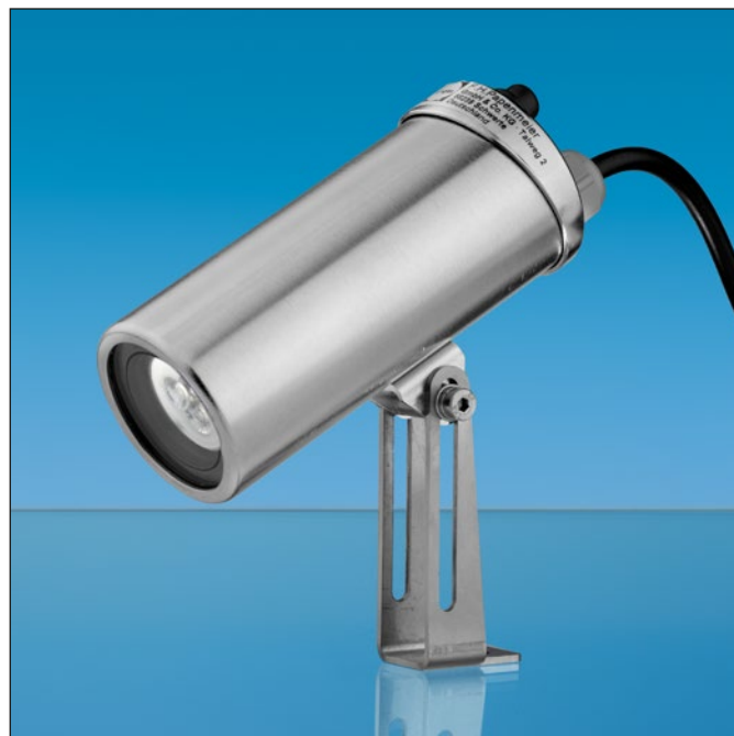
Lumistar luminaire USL 13-LED with hinged bracket