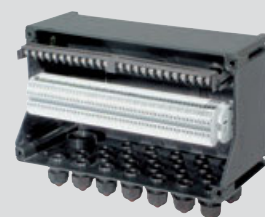
GHG 721 1001 R0004