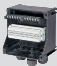
GHG 721 0001 R0011