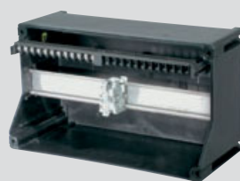
GHG 721 1001 R0003