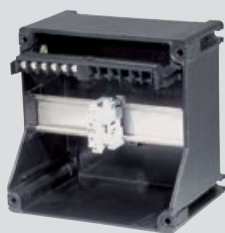
GHG 721 0001 R0001