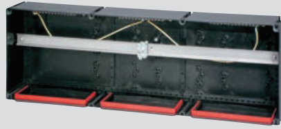
Type 749 04