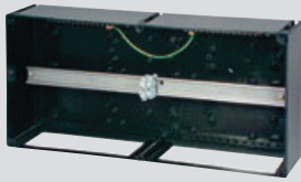
Type 746 03