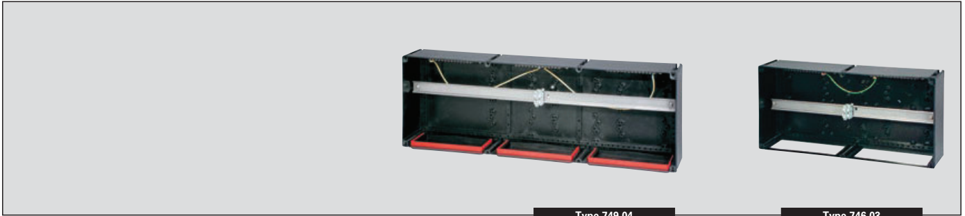
Type 749 04