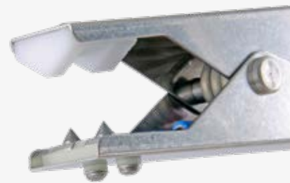
Tungsten Carbide Teeth