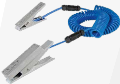
Bond-Rite EZ with large heavy duty clamp and 5m of Cen-Stat™ protected cable. Also available with standard size heavy duty clamp.