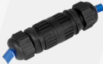
In-Line Quick Connect